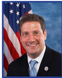
Rep. Tim Ryan (D-OH-13)