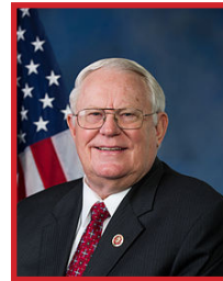
Rep. Joe Pitts (R-PA-16)