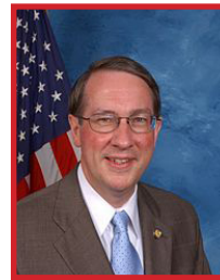
Rep. Bob Goodlatte (R-VA-06)