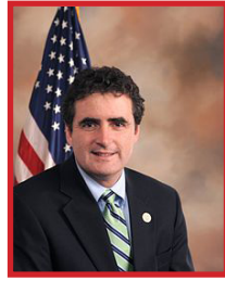
Rep. Mike Fitzpatrick (R-PA-08)