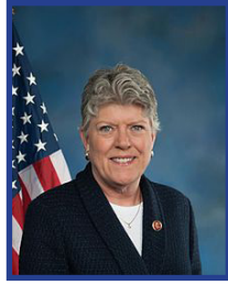
Rep. Julia Brownley (D-CA-26)