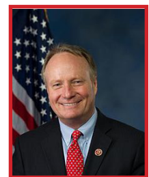
Rep. Dave P. Joyce (R-OH-14)