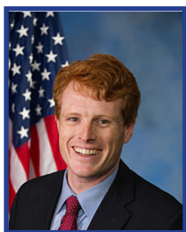
Rep. Joseph Kennedy III (D-MA-04)