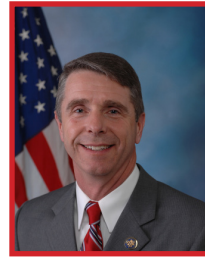
Rep. Rob Wittman (R-VA-01)