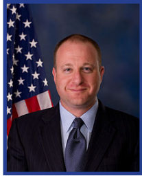
Rep. Jared Polis (D-CO-02)