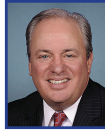
Rep. Mike Doyle (D-PA-14)