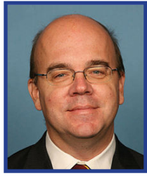
Rep. Jim P. McGovern(D-MA-02)