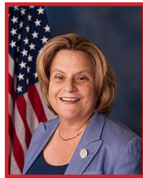
Rep. Illeana Ros-Lehtinen (R-FL-27)