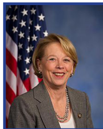
Rep. Niki Tsongas D-MA-03