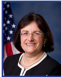
Rep. Ann McLane Kuster (D-NH-02)