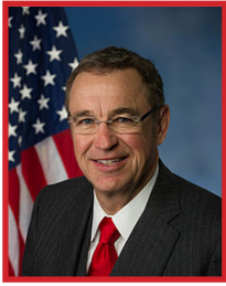
Rep. Matt Salmon (R-AZ-05)