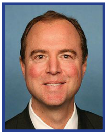
Rep. Adam Schiff (D-CA-28)