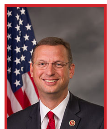
Rep. Doug A. Collins (R-GA-09)