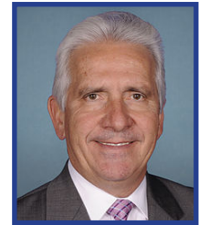
Rep. Jim Costa (D-CA-16)