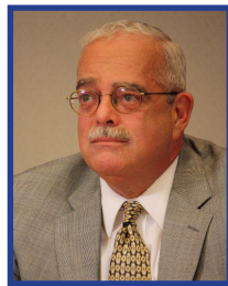
Rep. Gerald Connolly (D-VA-11)