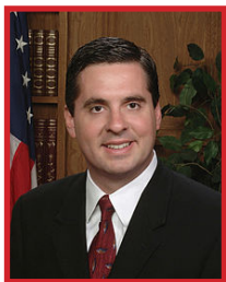
Rep. Devin Nunes (R-CA-22)