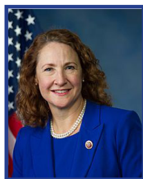
Rep. Elizabeth Esty (D-CT-05)