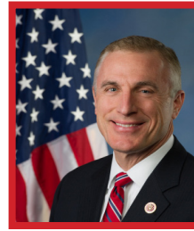
Rep. Tim Murphy (R-PA-18)