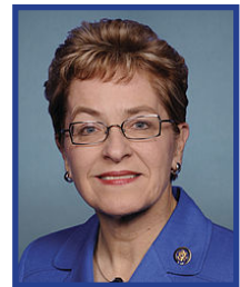
Rep. Marcy Kaptur (D-OH-09)