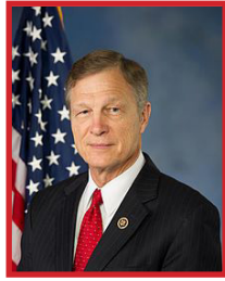
Rep. Brian Babin (R-TX-36)