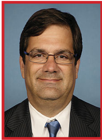
Rep. Gus Bilirakis (R-FL-12)