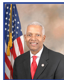
Rep. Hank Johnson (D-GA-04)