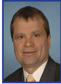
Rep. Mike Quigley (D-IL -5)